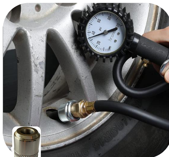
Secure Lock & Tight Seal